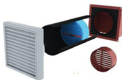
125mm Core drill ventilator